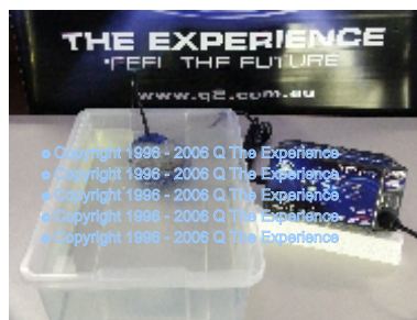
After 35 minutes

As an indication of how the technology has changed and improved this is a temperature experiment that was conducted in July 2005 using the latest model 4105 system with the latest Orb. The water is the same tap water as the earlier experiment was done in. The temperature is within 2° degrees celsius of the original experiment. Check the front page again.