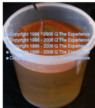
After 35 minutes

Experiment carried out using earlier model 3024 power supply and an Array.