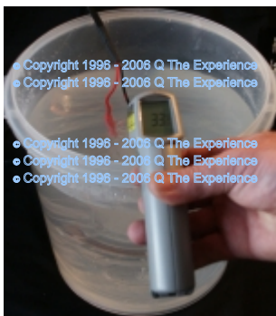
Water temperature 33° Celsius

It really is not possible to discern meaning in the water post session other than at an energetic level. Our experience has been that as a persons' energy field becomes more balanced or coherent (i.e. as their body comes back into balance), their energy field contributes less to the destabilisation of the positive rings, and therefore, there is generally less discolouration of the water. In fact, we've seen that a coherent energy field (someone who is in balance) can have a stabilizing affect on the process, so much so that the water colour/sediments/textures for these individuals is lighter/different and in some cases non existent than the baseline water without anyone in it.