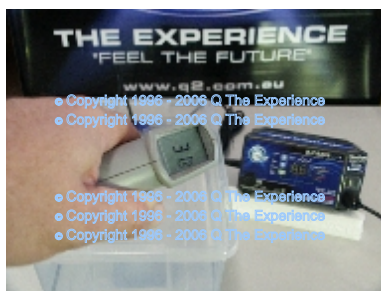
Water temperature 31° Celsius

It was read somewhere recently where it was said for a person to Detox through their feet the amount of toxins excreted in urinating once it would take no less than ten days. Your body knows what the primary area of concern is, it also knows what it has to do to achieve a turnaround in that condition and it will do this in the safest and quickest way possible with the least amount of disruption to your everyday life.