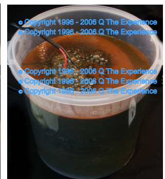
After 35 minutes

There are interesting energetic exchanges that can be observed with different individuals having a session but at this time we have not found any reliable method that can evaluate what these sediments may indicate or represent due to the incredibly large number of variables present for each individual session.