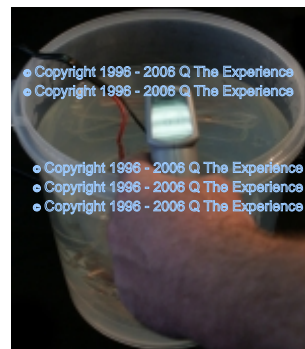
Water temperature 61° Celsius

Experiment carried out using earlier model 3024 power supply and an Array.