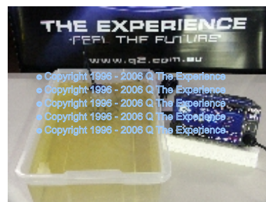
Same unit same water source same day different temperature. 47°